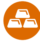
Analysis of unstructured data