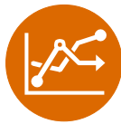
MIS dashboard automation