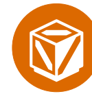
Industry-specific data marts