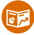
Insights driven organisation