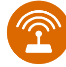
Analysis of sensor data, wearables, IoT